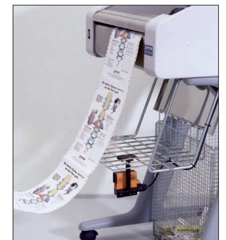
on-line connection to printer