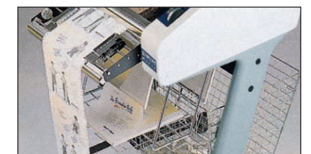
pre-decollating station for refolding in-line